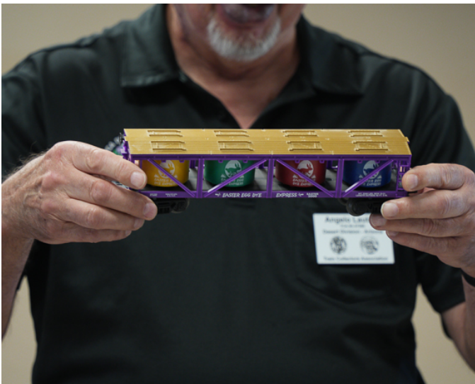
A closeup view of the Easter egg vat car.

The meeting concluded with raffle drawings and Paul Wasserman won the $100 Hudson drawing.