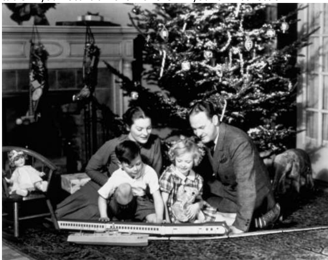
1930s FAMILY PLAYING WITH TOY TRAIN IN FRONT OF CHRISTMAS TREE Fireplace

More to the point, some of these trains undoubtedly sit on someone's table in your local train show or even in your own collection.