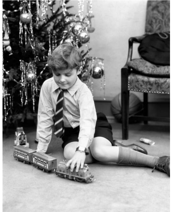
1930s YOUNG BOY PLAYING WITH TOY TRAIN BY CHRISTMAS TREE

It may not be far-fetched that some kid who died on the beaches at Normandy had their trains on a table at the Blue Hall in York or at a local train show. And if we could find that engine, there probably is a story attached to it of an excited little boy opening a package next to a Christmas tree with the family huddled around. There are probably stories to be told of a proud dad sharing the joy of that train with his son in, what would turn out to be all too few precious moments.