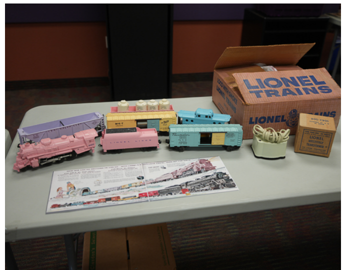
The catalog, the box, and the train set.

Angelo closed out the education segment with a Beatles aquarium car that was more psychedelic than pastel. He presented the one Easter themed item with an egg dye Lionel vat car that was part of Barbara Lautazi's collection. Finally, he presented two pink Cadillacs that were parked in front of the